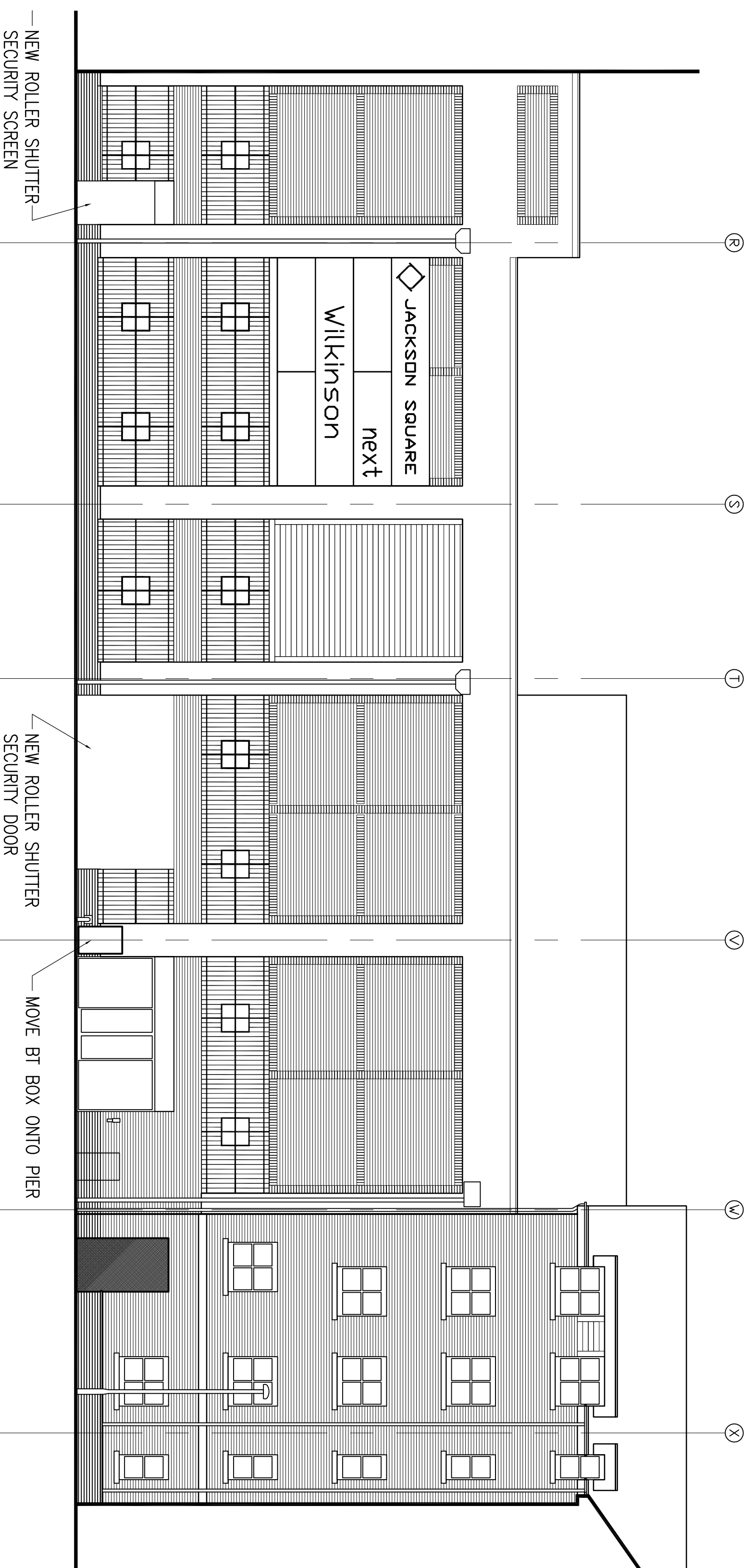
CARPARK ELEVATION PROPOSED (1:100)